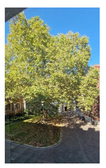
View from lounge