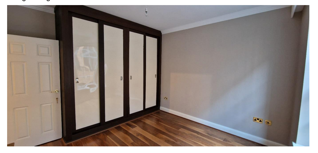
Double bedroom with fitted wardrobes