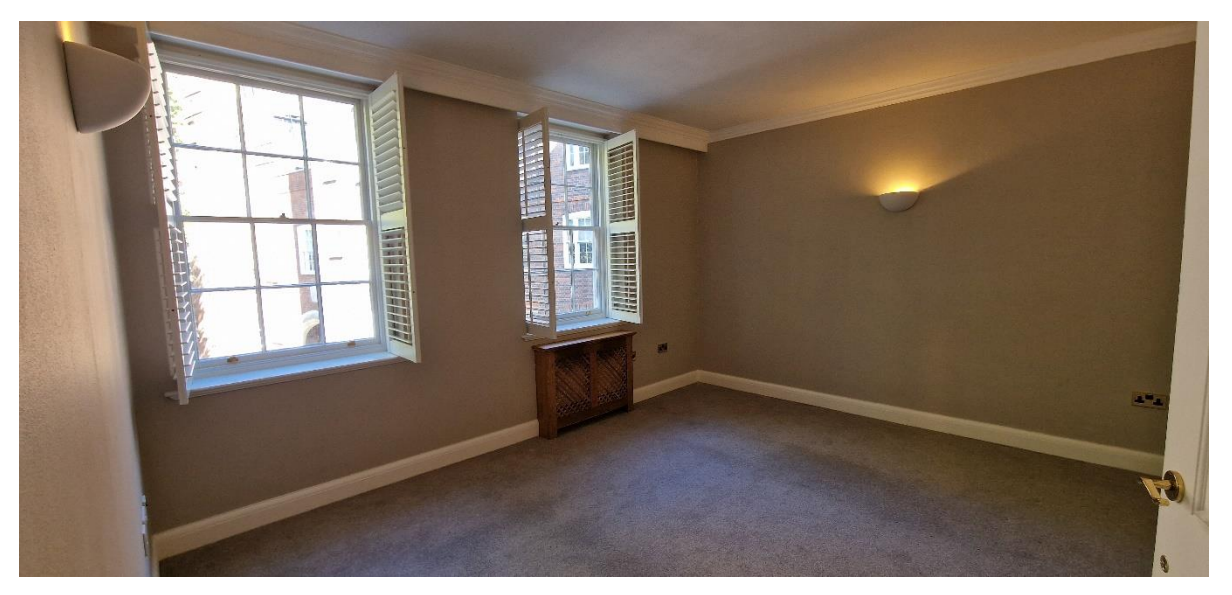
Large lounge with views of Gatehouse Court

Rent is £21,320 on an Assured Shorthold Tenancy for 4 years reviewed after 2 years